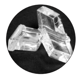
WAFFLE ICE Approx. Size 7/8" X 1/2" X 1"