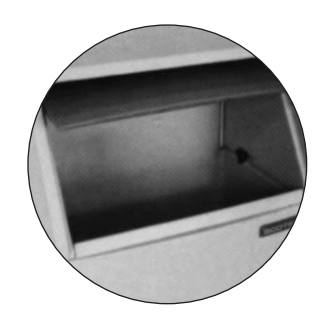
SLIDE AWAY ACCESS DOOR Provides convenient and easy access to ice.