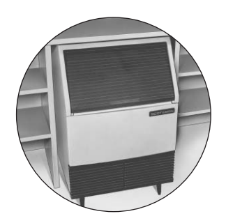
UNDERCOUNTER INSTALLATION Adapts to numerous undercounter applications. Fits under any 40" counter.